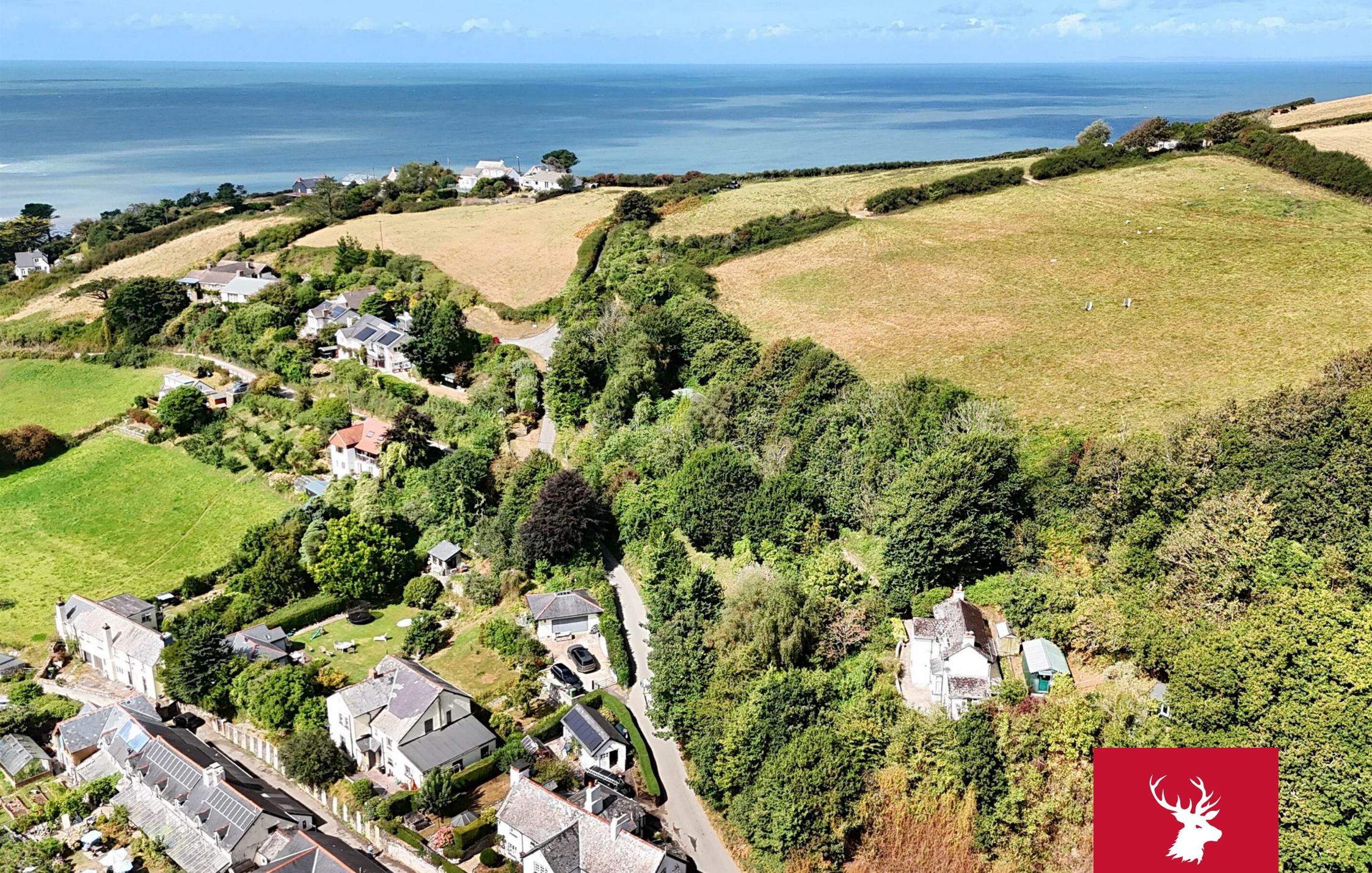
Wall Garden Cottage